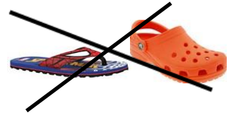
Un acceptable Sandals or Crocs