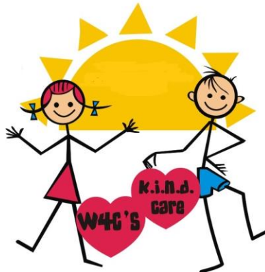
Williamsburg Community Child Care Center Kids In Need Of Daily Care

Welcome to the Williamsburg Community Child Development Center (W4C's/K.I.N.D. Care). We are so happy that you have selected us to care for your most precious possession! We look forward to getting to know you and your child and watching them learn and grow.